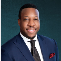
Nexus Sea Partner O'Melveny & Myers